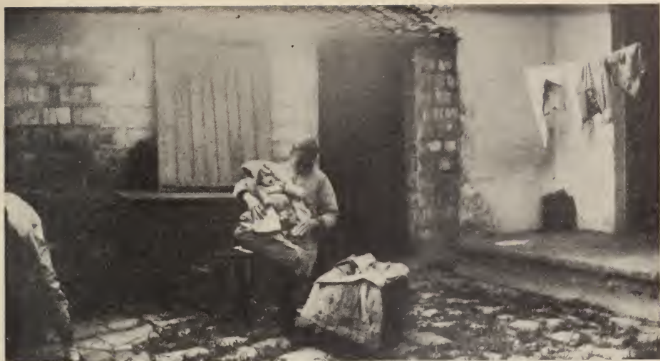
"THE INFANT WE TOOK FROM THE HOVEL"

rance is constantly knocking at our very doors.